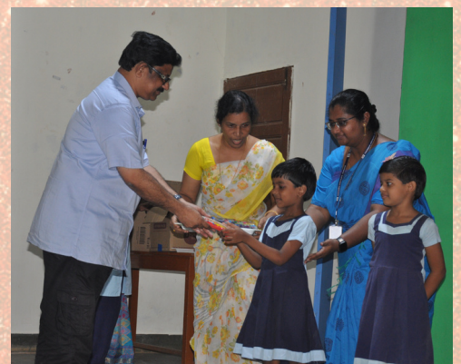
Children's Day Programme