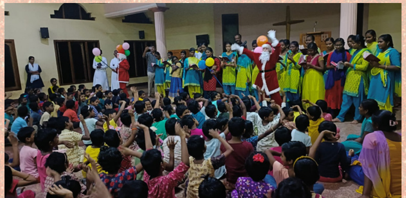
CSI Church, Dohnavur, visiting our campus during their Carol Rounds