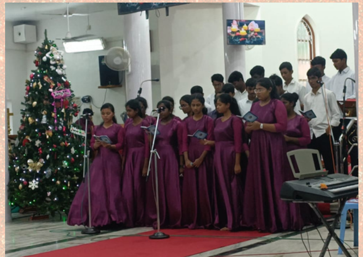
The Senior Choir spreading Christmas cheer at CSI Church, Kalungadi and Military Line Church, Tirunelveli