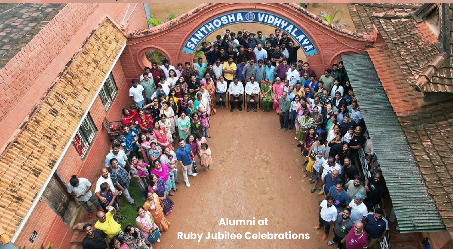
Alumni at Ruby Jubilee Celebrations

A dynamic alumni treasure hunt and photo gallery provided engaging experiences, and despite the rain, a friendly yet competitive football match for boys and throwball match for girls took place, allowing participants to showcase skills, share experiences, and foster a sense of community.