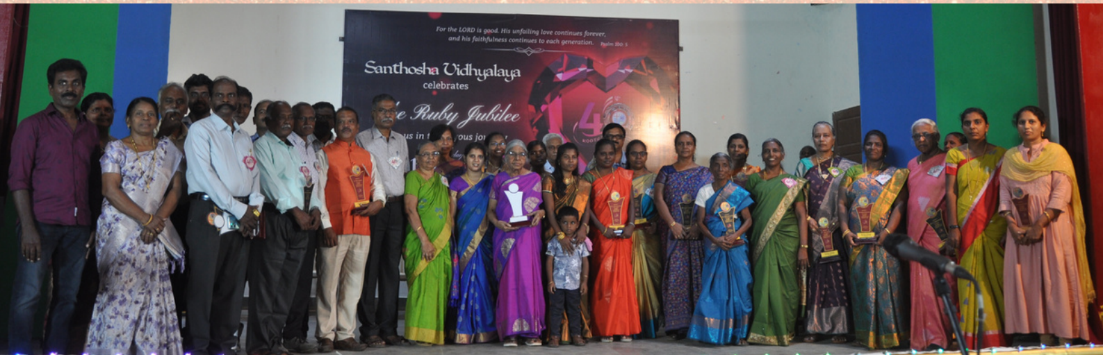
Retired & Former Teachers / Staff of Santhosha Vidhyalaya