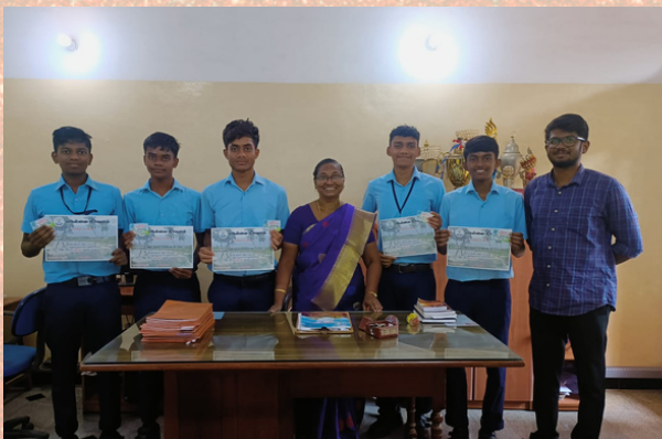
Eco club - Environmental Awareness Campaign by the XI boys